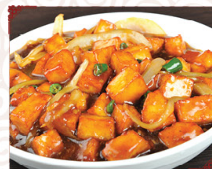
V7 Chili Paneer