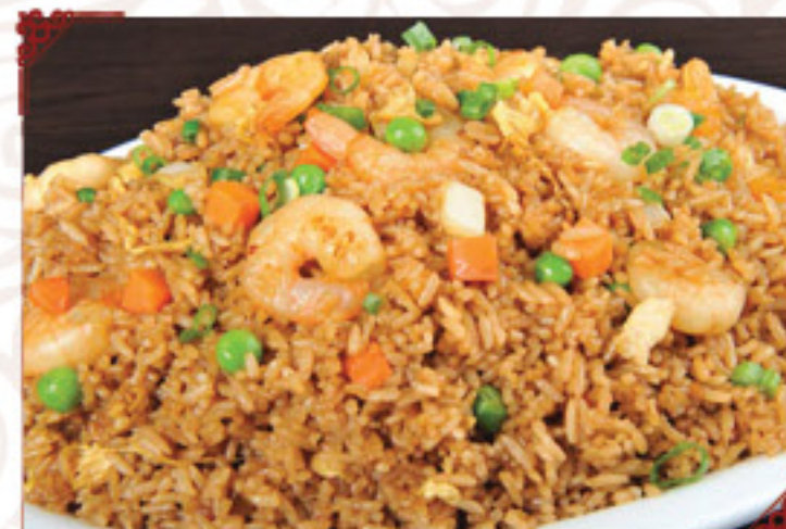
R2 Shrimp Fried Rice