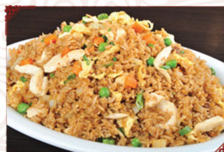
R2 Chicken Fried Rice