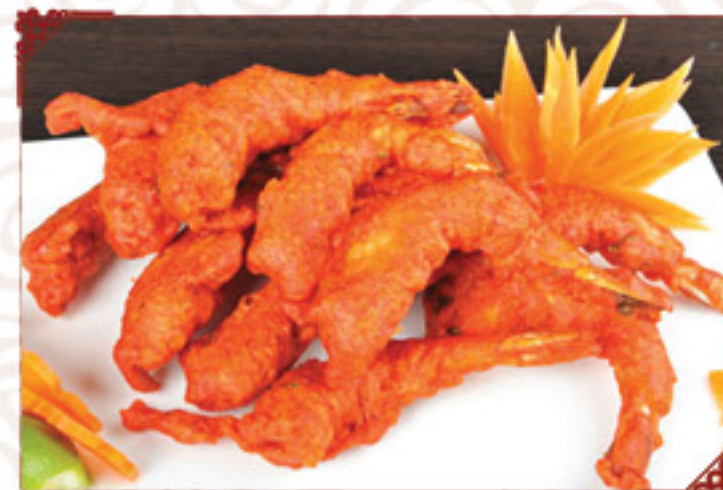
A6 Shrimp Pakora