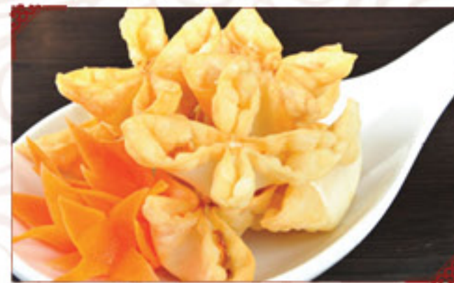
A3 Cheese Wonton