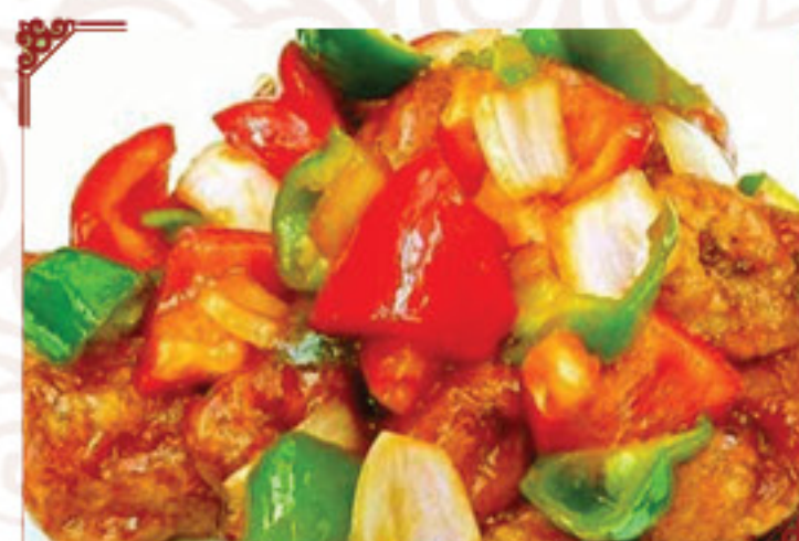
T1 Mango Chicken