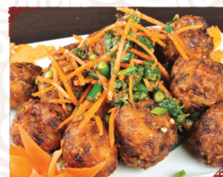
V9 Manchurian Pakora