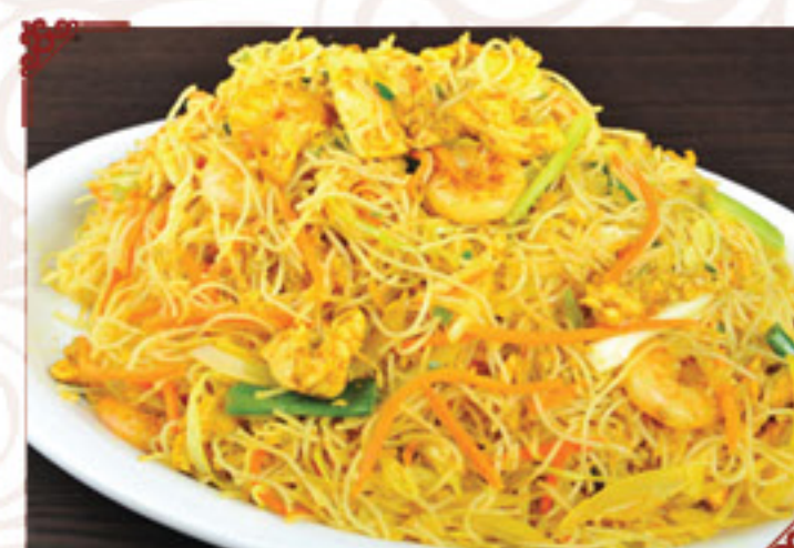
N6 Singapore Rice Thin Noodle