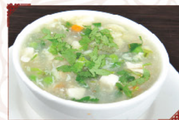
S10 Manchurian Soup