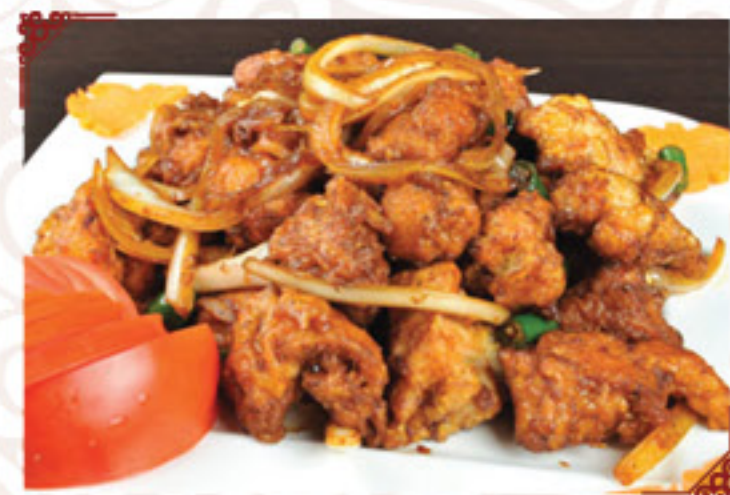
C1 Chili Chicken