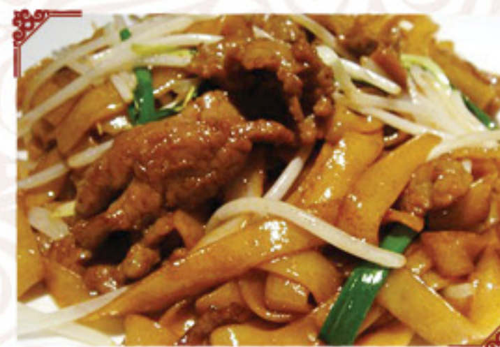
N10 Beef Ho Fen