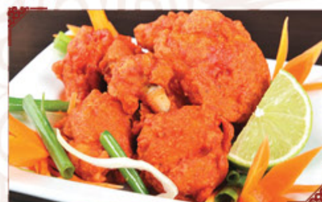
A5 Lollipop Chickens