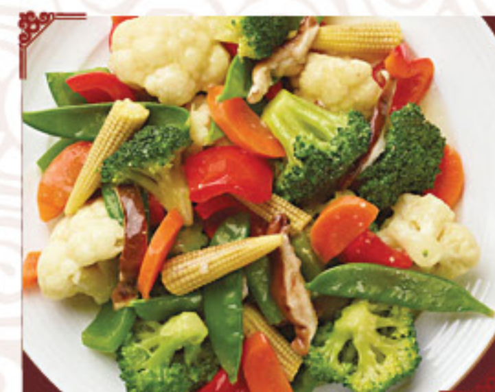
V16 Vegetables Delight