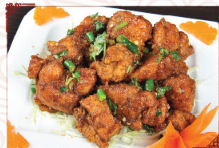
C2 Manchurian Chicken