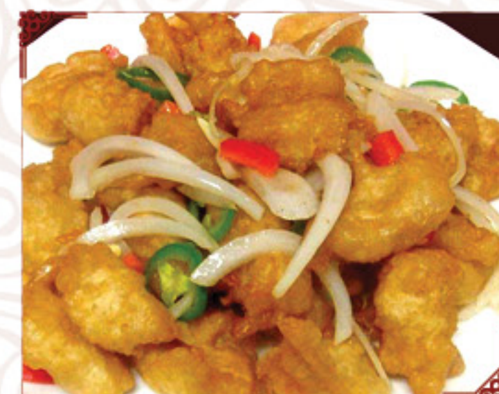
F13 Salt & Pepper Fish