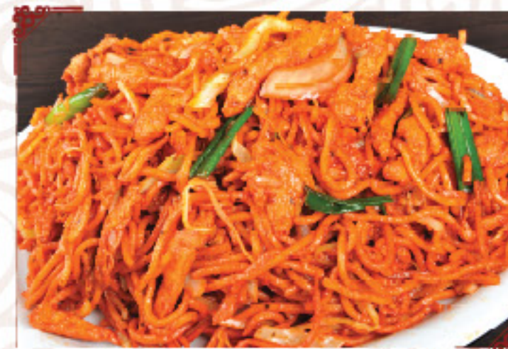
N3 Manchurian Chow Mein