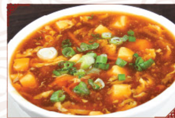
S2 Hot Sour Soup