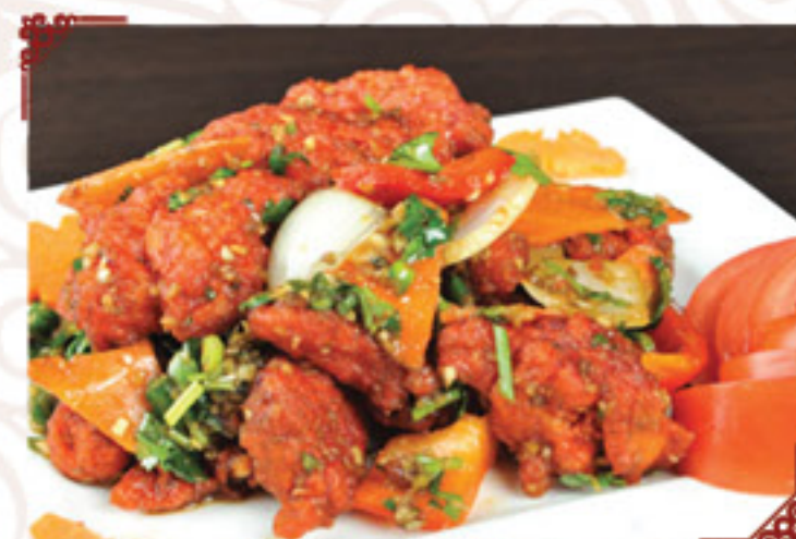
C20 Masala Chicken