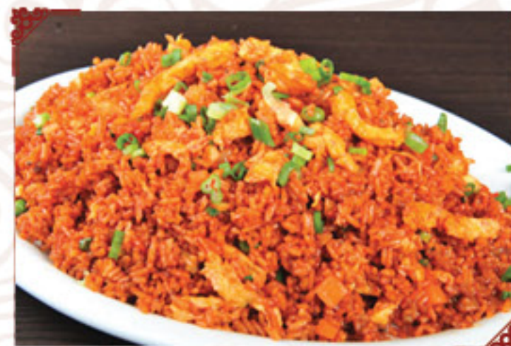
R3 Manchurian Fried Rice