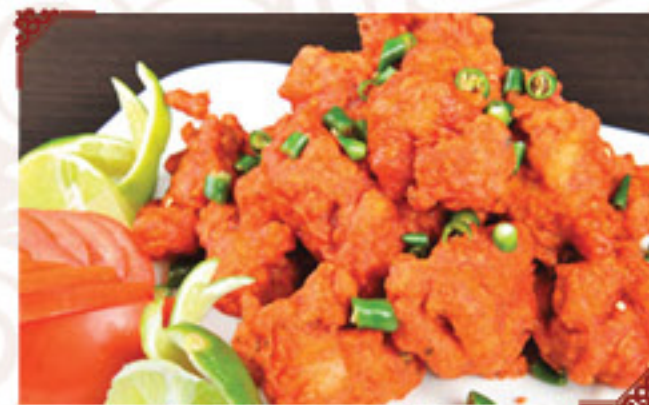
A6 Chicken Pakora