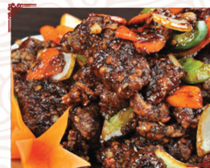
B14 Crispy Beef