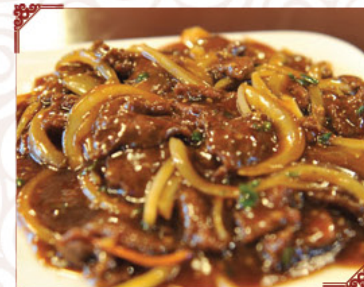
B1 Chili Beef